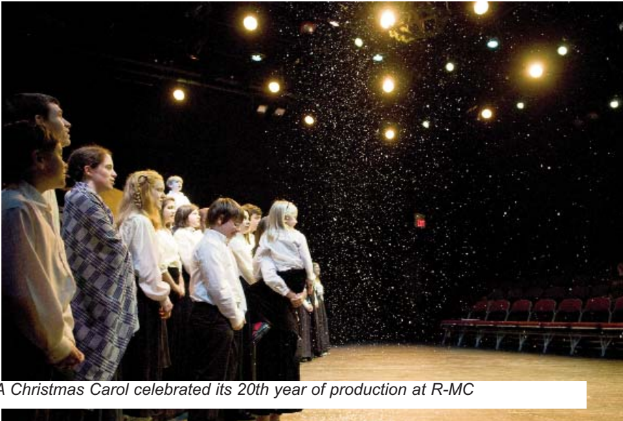
A Christmas Carol celebrated its 20th year of production at R-MC

To view a photo gallery of A Christmas Carol , click here .